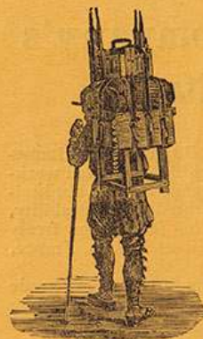
Old Style Equipment.