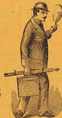
New Style Equipment.